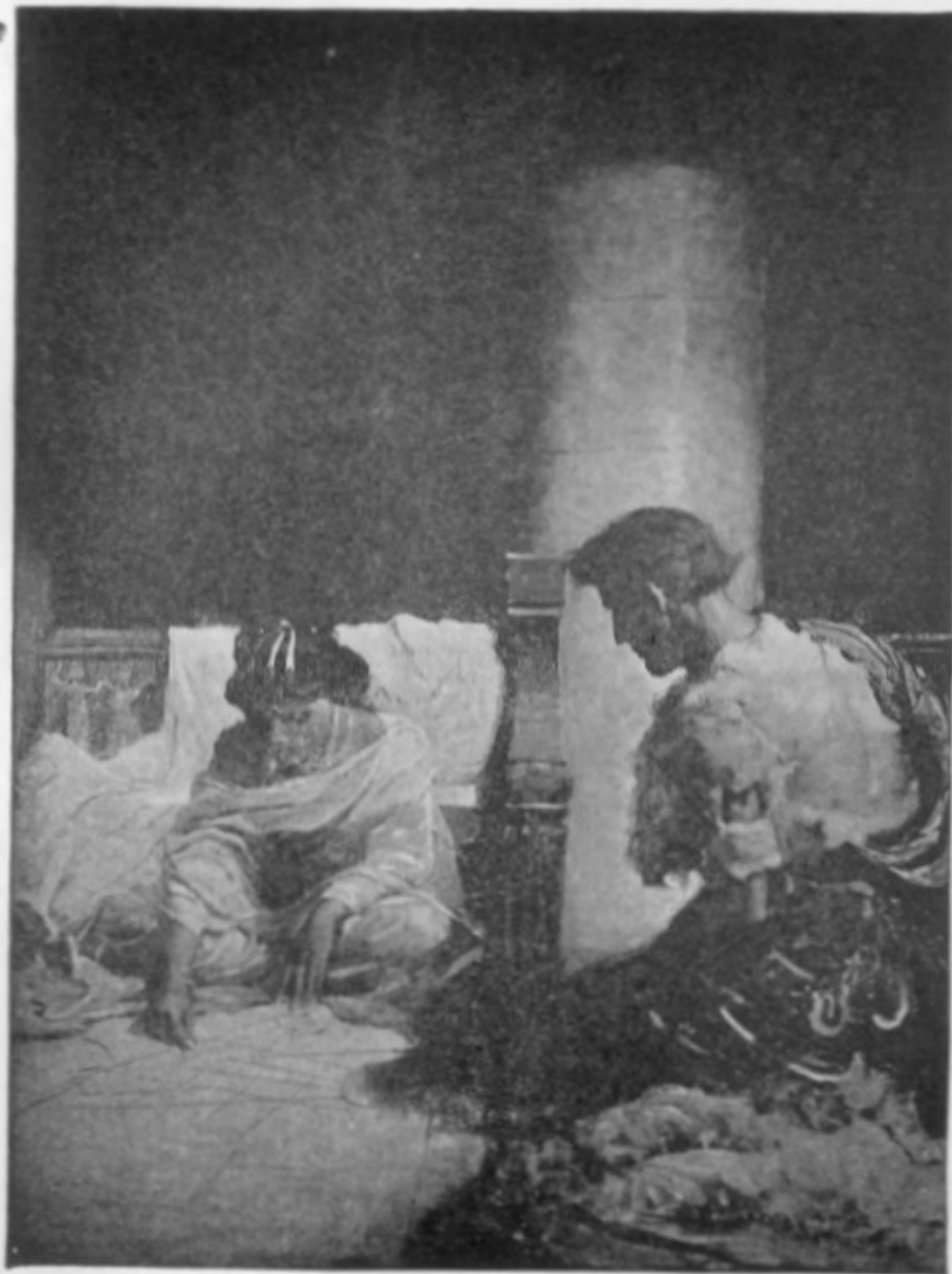
SHE DREW UPON THE MARBLE FLOOR THE FIRST MAP OF THE BARSOOMIAN TERRITORY I HAD EVER SEEN. Page 178